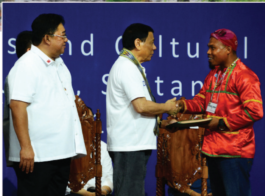
Duterte hands a CLOA to a farmer- beneficiary as Secretary Castriciones looks on.

DAR records show that some 561,000 hectares of